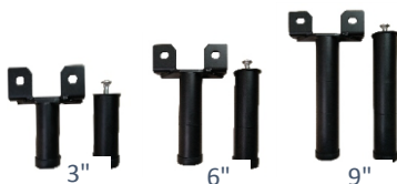
Adjustable Leg Height Three Different Leg Heights to Fit Most Bed Frames 3 Inches, 6 Inches, and combined for 9 inches