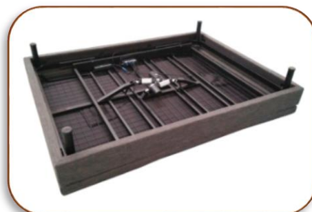
Corner Legs (4 PCS) Corner Leg Bolts (4 PCS)