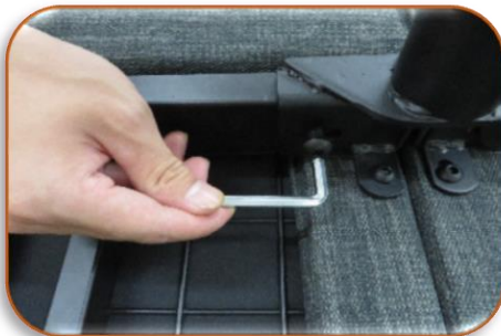
Middle Legs (2 PCS) Middle Leg Bolts (4 PCS) 1-Allen Key