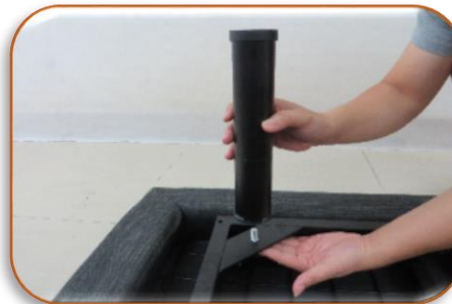
Corner Legs (4 PCS) Corner Leg Bolts (4 PCS)